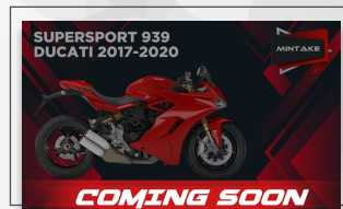
SuperSport 939 Standard and S version 2017-2020