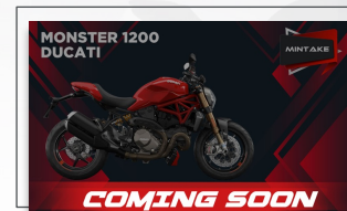
Monster 1200 Standard, S and R version 2014-2021